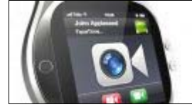
Rumors that Apple is creating an iWatch