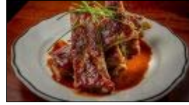
Tasty food, old-time vibe at Bull Valley Roadhouse