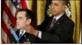
Army vet receives Medal of Honor