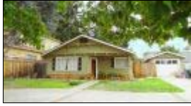
$1M-plus fixer-uppers: Only in the Bay Area